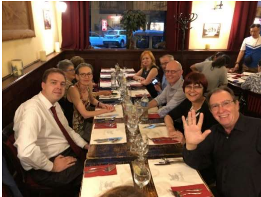
ISPOG ExCo dinner in Budapest May 2019. Countries represented: Hungary, Spain, The Netherlands, Australia, Germany, Switzerland, Ukraine.